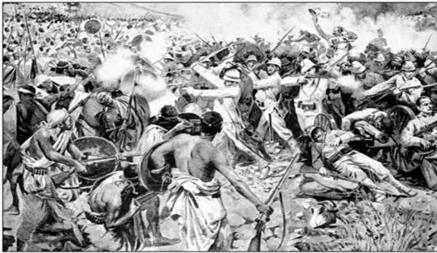
Figure 2. Antique illustration of the battle of Adwa in March 1, 1896

valuable insights into the strategic, cultural, and human dimensions of Ethiopia’s historic victory, shedding light on the dynamics that shaped this defining moment.