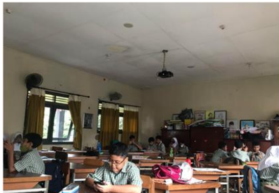
Figure 4. Learning activities using Google Site media

The teacher's involvement in combining technology, media and materials is important. If students have questions regarding the learning media chosen, the teacher must be able to explain so that students are clear. Teachers should give students the opportunity to think critically by asking questions when the media is used, so that students' activeness will be more visible and increase automatically. The teacher must always provide the motivation given to students to be diligent in studying and practicing. According to Susilana and Capi, (2006: 111) student participation in the material and media and technology used during learning is the main goal in learning itself. The involvement of students in using technology, strategies and teaching materials is important in achieving their learning goals. The learning process that applies new knowledge or abilities and receives feedback is an important activity in the learning process.