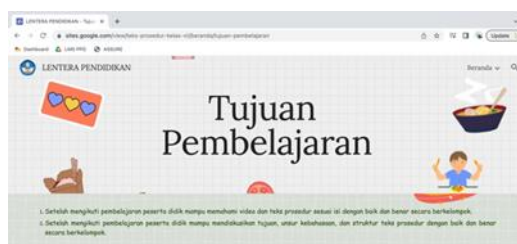
Figure 2. Display of learning objectives on the Google Site

learning objective: students can discuss the objectives, linguistic elements and structure of procedural texts well and correctly in groups.