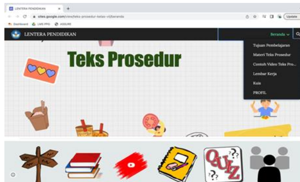
Figure 1. The Initial appearance of Google Site

The creation of learning media is carried out through the ASSURE learning model. In its implementation, the ASSURE model learning design according to Smaldino (2011: 110) has six steps that need to be carried out: (1) analyzing learning participants, (2) determining standards and objectives, (3) choosing methods, media and materials, (4) using methods, media and materials, (5) learner participation, and (6) evaluating and revising. The six steps revealed by Smaldino will be used by researchers in implementing the ASSURE model learning design.