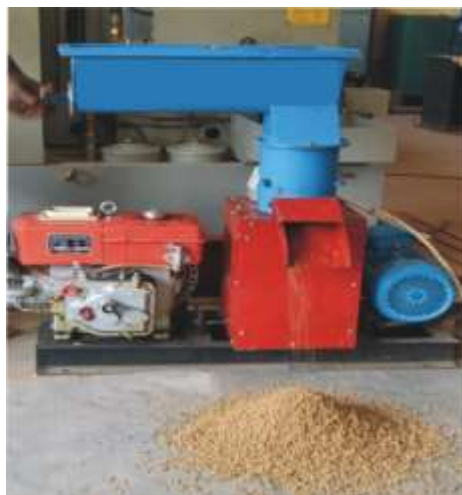
Figure 1. The developed Poultry Feed Pelleting Machine during performance testing

The concept of the design centered towards pelleting of strong and good texture pellets. The major components of the designed machine were captured fully in the design. The designed production drawing for this machine is shown below.