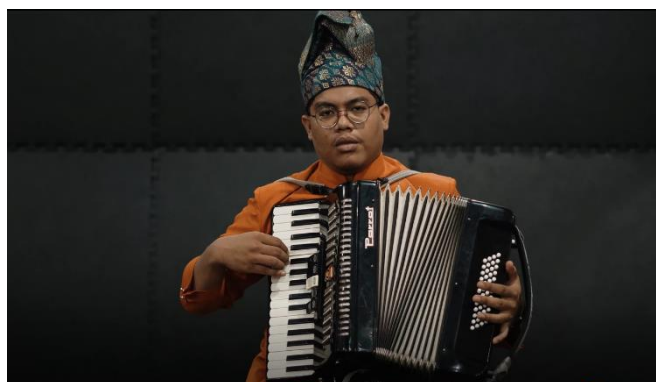
Figure 8. Accordion Game Tutorial on Sri Langkat Songs