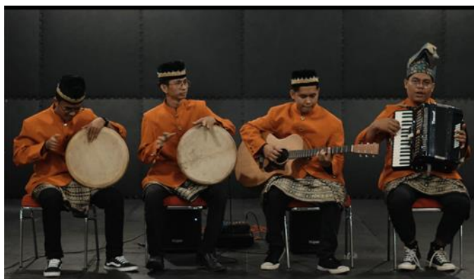
Figure 7. The Musical Instrument Used in the Sri Langkat Song