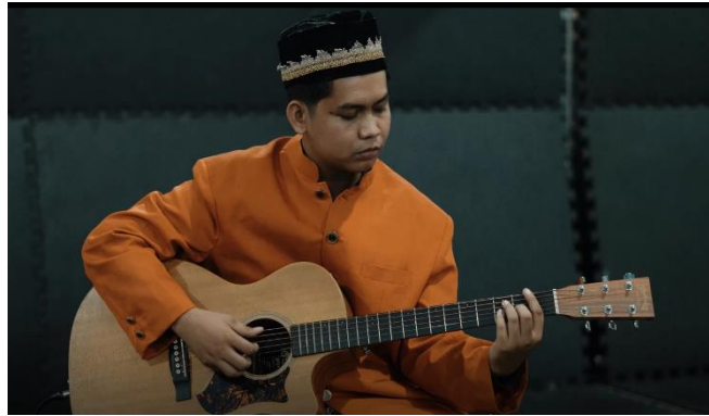
Figure 11. Guitar Game Tutorial on Sri Langkat Songs