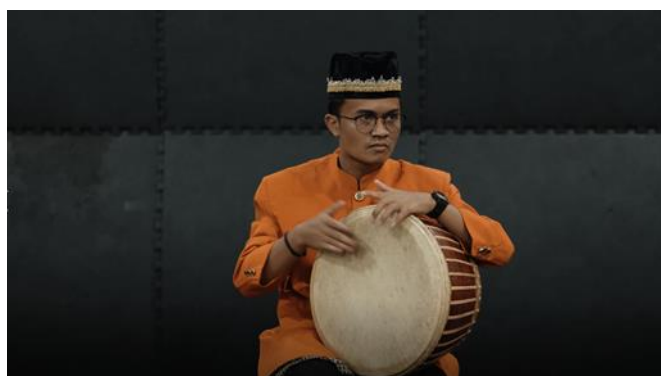
Figure 9. Tutorial on Playing Drums for Children in Sri Langkat Songs