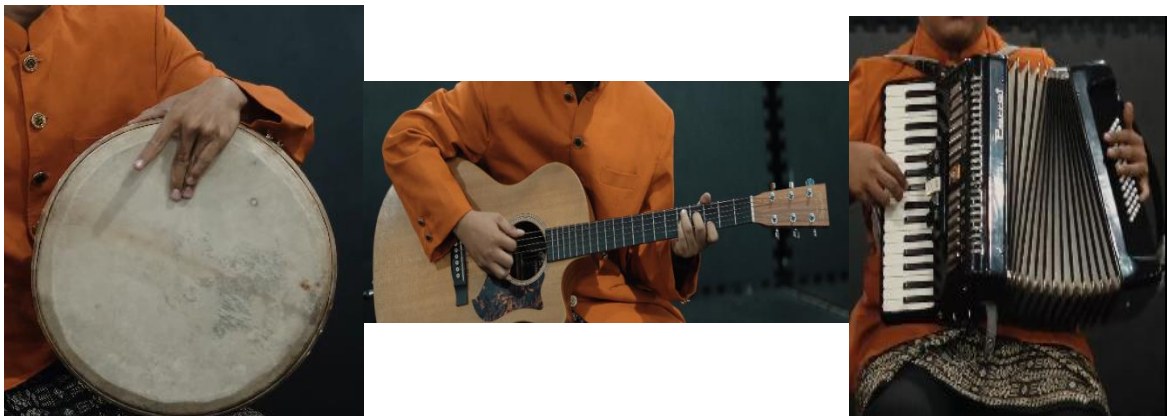
Figure 5. Musical Instruments used in Sri Langkat Song

In general, traditional Malay musical instruments consist of an accordion, a Malay drum (main drum and child drum) and a gong. In the research, the musical instruments used in Sri Langkat's songs are the accordion, the Malay drum (main drum and child drum), and the acoustic guitar. The selection of this musical instrument is to be easily obtained and learned by junior high school students as well as to give the sound color to the Sri Langkat song.