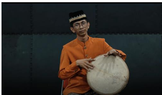
Figure 10. Game Tutorials the Parent Drum on the Sri Langkat Song