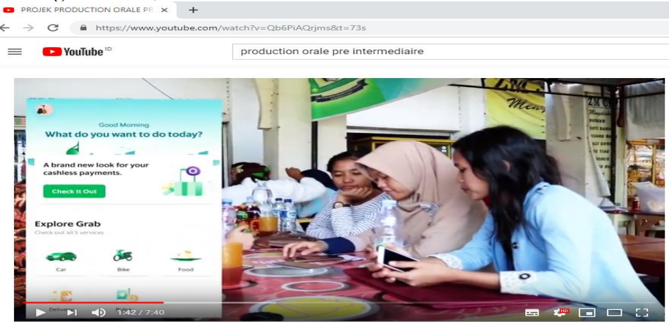
PROJEK PRODUCTION ORALE PRE INTERMEDIAIRE

When students make YouTube making process, the learner will find problems such as the recording does not produce clear sound, images are not good and taking positions when shooting. The process also trains students to be able to make teaching materials based on local culture. The situation and atmosphere of the location reflecting the culture in Indonesia is certainly different from the situation in France. Therefore it is very important to make teaching materials based on local culture. The development of this teaching material aims to help learners understand French with the local cultural situation that is used to improve listening skills using YouTube. One example of making teaching material about the Grab application using YouTube, as below: